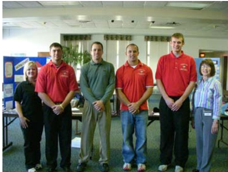
HLED 310 Alcohol, Tobacco and Drug class poses for a photo prior to the Alcohol Awareness event in the campus center.

for Heart, and Hoops for Heart. One event that we are really looking forward to is the Ohio Association for Health Physical Education Recreation and Dance (OAHPERD) state convention. The convention will take place December 3 rd -5 th in downtown Columbus. This will be my first year attending the convention but I am really looking forward to it! We are going as an Otterbein group, so if you are interested please contact either one of us! There will be many great ideas for upcoming students; as well as great networking opportunities. If you have the opportunity to attend I would highly suggest it! Please keep your eye out for information about our Jump Rope for Heart and Hoops for Heart activities. We will be having a 3 on 3 tournament during winter quarter. Please also keep your eye out for information about our next Health and Physical Education club meeting. Hope to see you there!