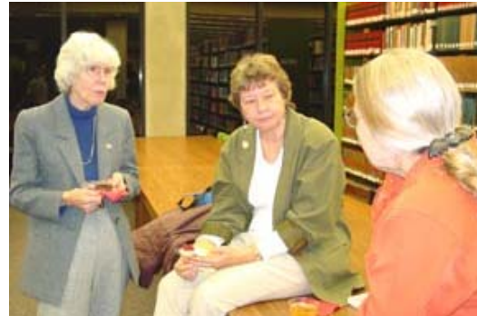
Friends members conversing after Ozeki's lecture

On Tuesday, October 29, 2002 novelist and independent filmmaker Ruth Ozeki presented a thought-provoking lecture on the her book My Year of Meats . She also discussed her early experiences in media production, using the themes of her book to highlight the issues that arise in this field. Afterwards, she signed autographs for the crowd in attendance. The crowd included faculty and students alike.