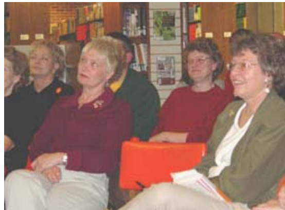
The audience enjoys Ozeki's presentation.