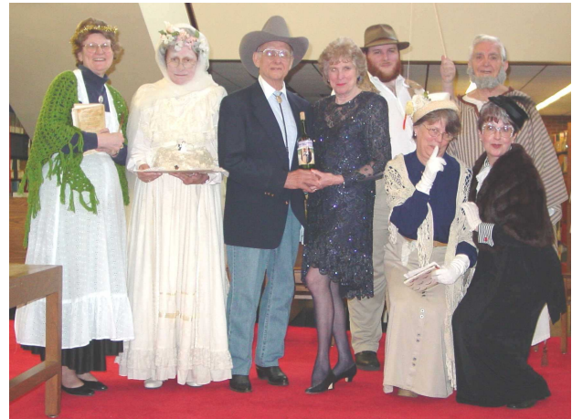
A short business meeting was held at the end of our event.