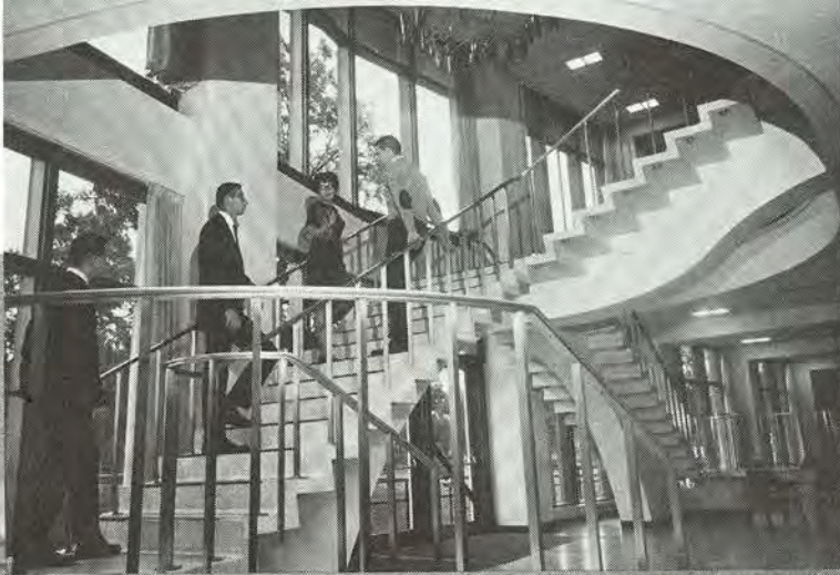
Spiral stairway adds beauty to lounge