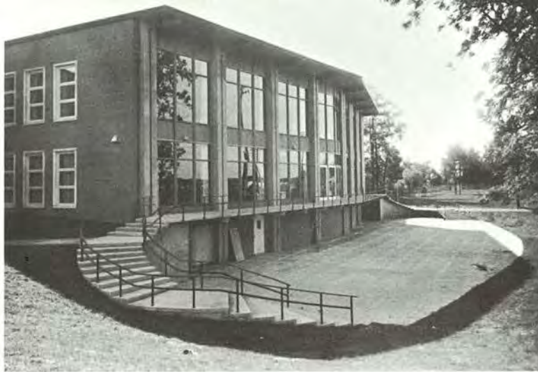
Rear of building has beauty of its own

This beautiful building which we dedicate on Homecoming Day, 1964, is the realization of a dream pursued by many people for many years. It stands where there was once a gravel pit. Fifty years ago, Otterbein College acquired the land for an athletic field — later it became a parking lot. At one time it was completely outside Westerville; today it is exactly in the center of the campus. It supports a structure which is a miracle of foresightedness, determined effort, and triumph over innumerable obstacles.