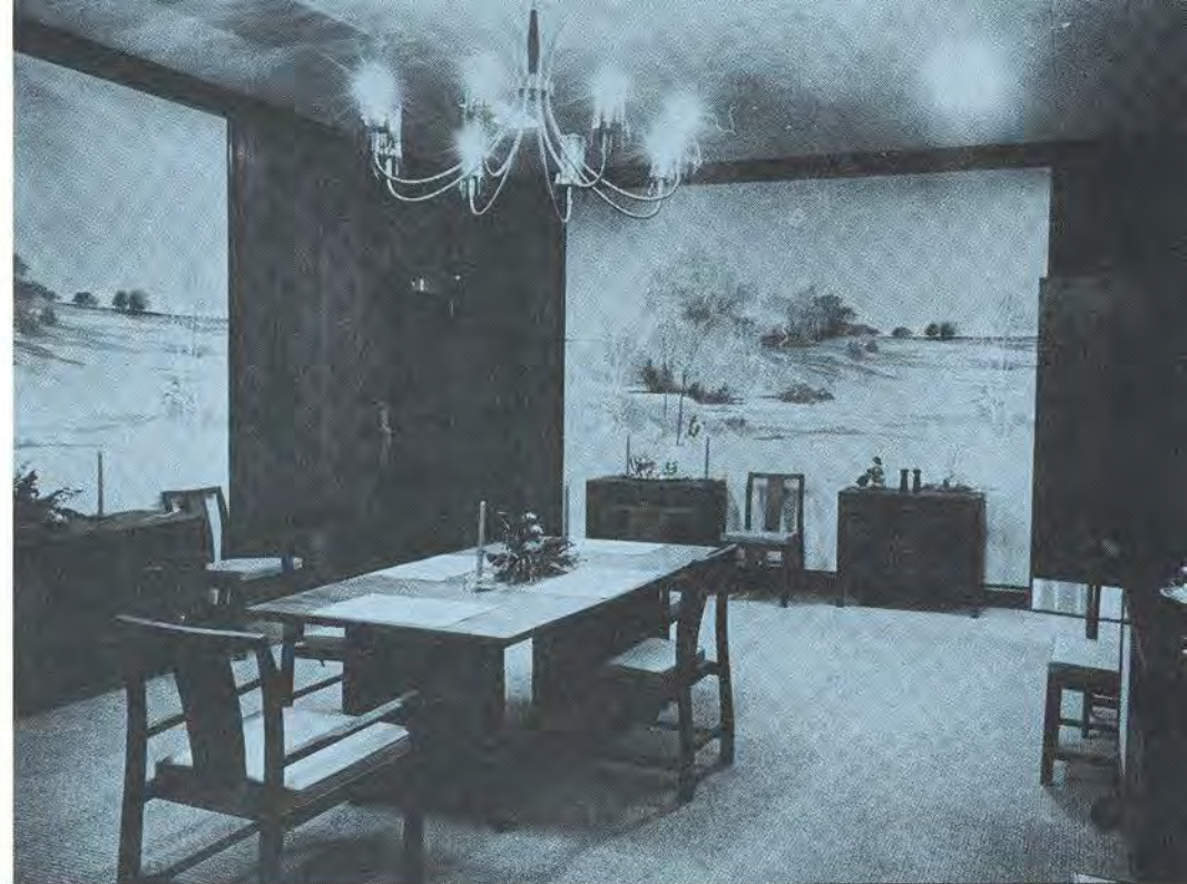
Special room for faculty dining