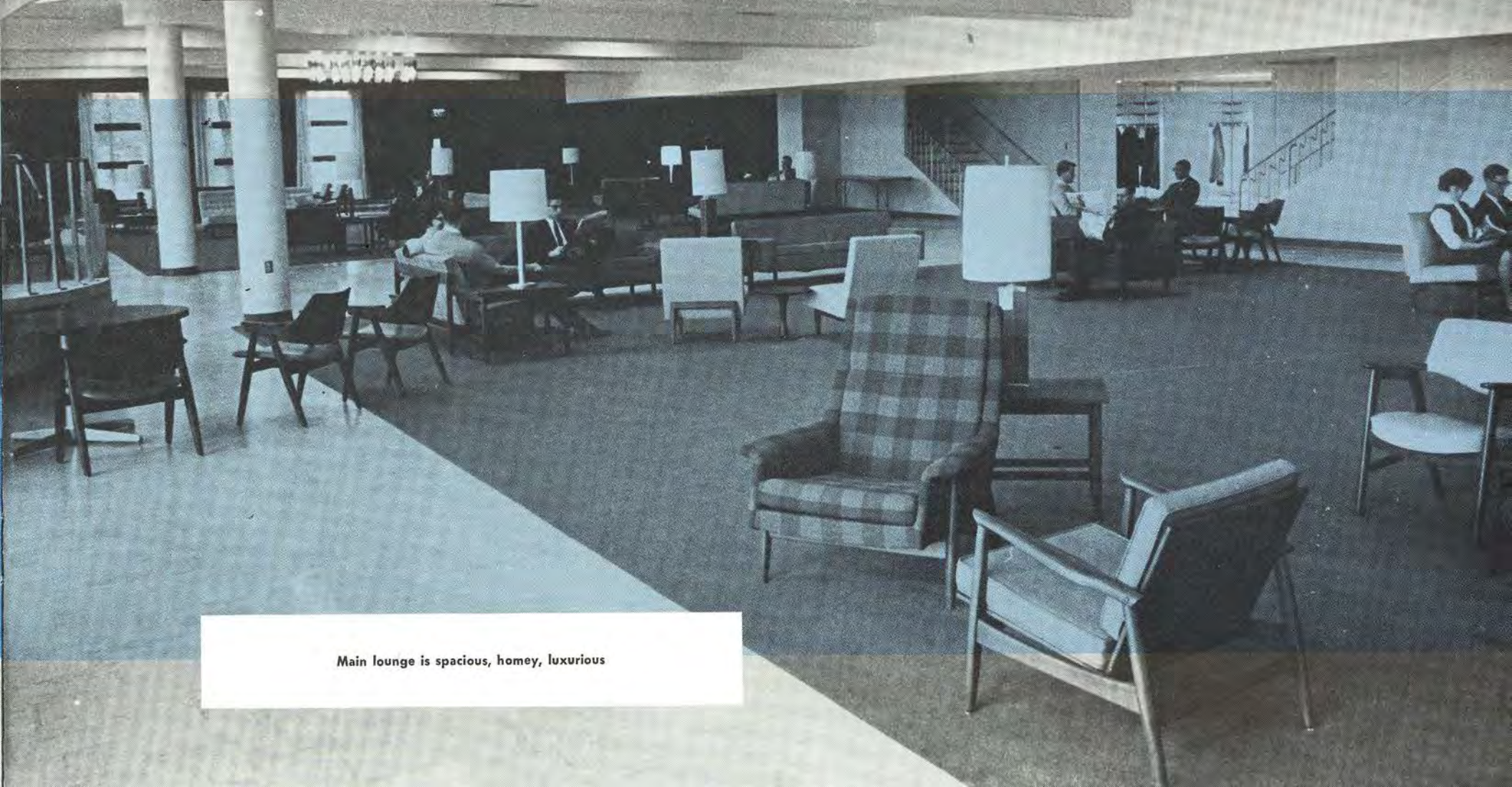
Main lounge is spacious, homey, luxurious