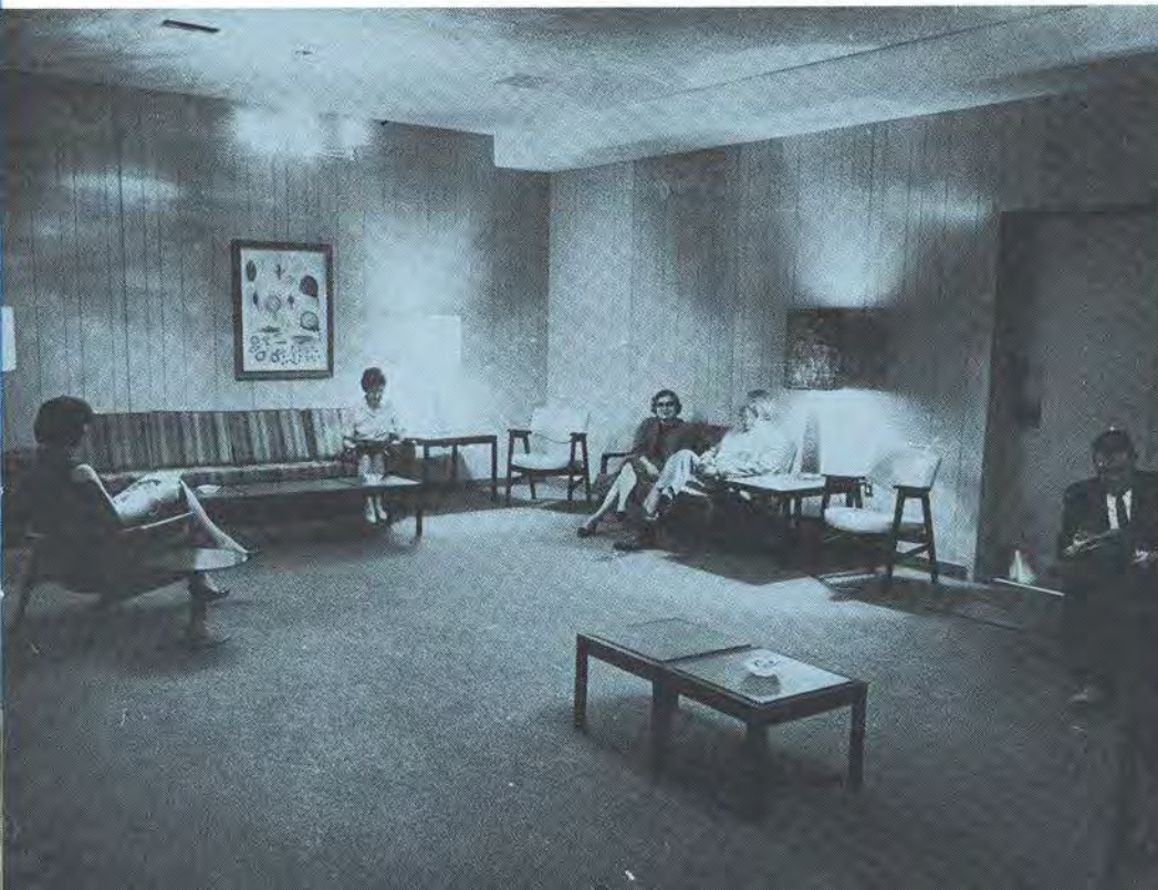
Faculty lounge for study, relaxation, discussions or receptions