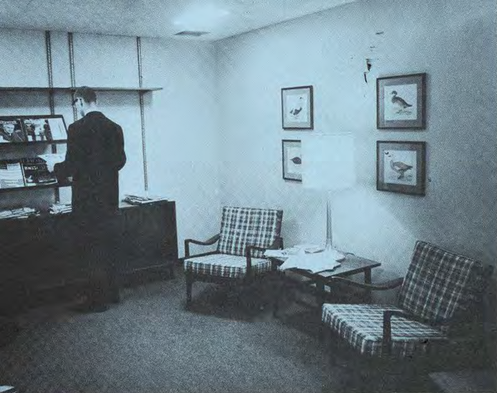
Reading room, where students can relax